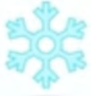
Snow-snow y =freezing Rain-