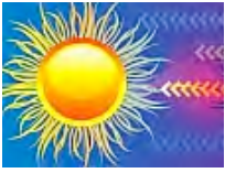
Sun-Sun ny = warm / hot