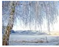
Ice-ic y = cold